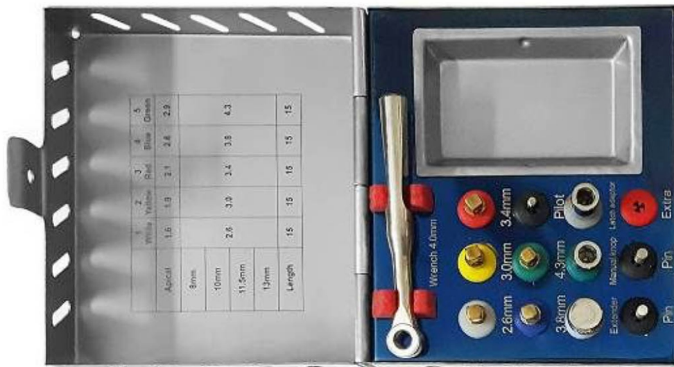
Implant Box Item Code: 87-001-035