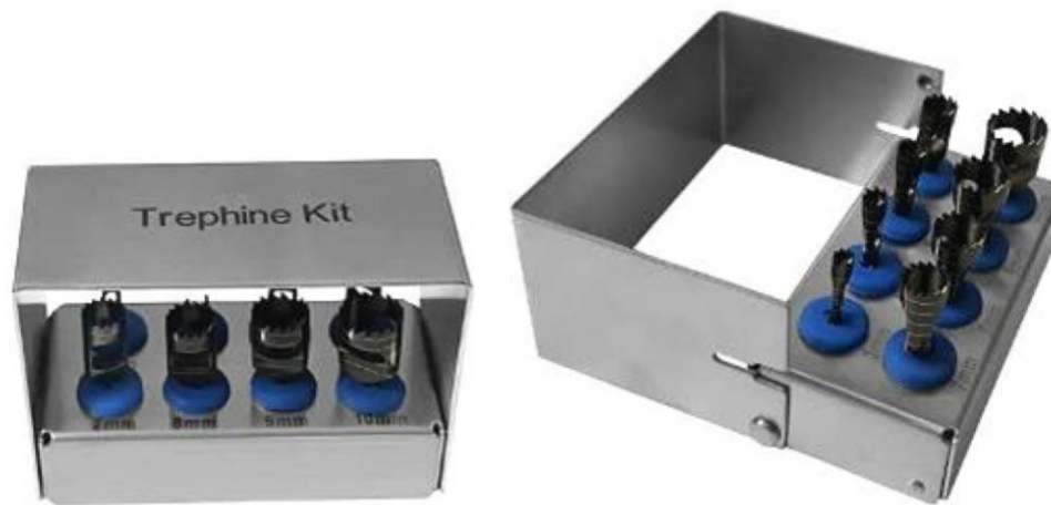
Trepine Drill Kit, 8 pcs. Item Code: 87-001-034