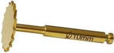
Bone Saw Disc

Item Code: 87-001-001, 6.0mm Item Code: 87-001-002, 8.0mm Item Code: 87-001-003, 10.0mm